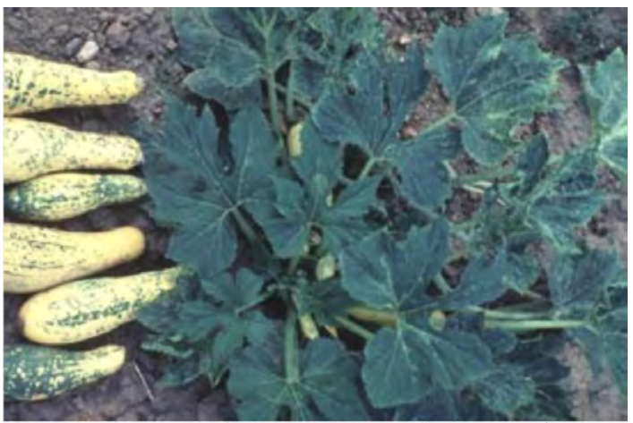
Figure 4. Watermelon mosaic (WMV) on squash foliage and fruit.

causes green mosaic, leaf rugosity, green veinbanding, chlorotic rings, and malformation on foliage, and green ringspots and mottling on fruit (Figure 4). WMV is spread by more than 20