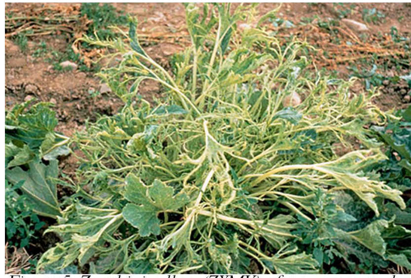
Figure 5. Zucchini yellow (ZYMV) of summer squash.

( ZYMV ). ZYMV is one of the most economically important diseases of cucurbit crops. When crops are infected before fruit set, total yield losses may occur. ZYMV causes yellow mosaic, extreme fernlike appearance of leaf tissue (Figure 5), and bumpy and mottled fruit. ZYMV is spread by several aphid species. Strategies to reduce the spread of ZYMV include removal and destruction of old cucurbit crops, any wild or volunteer cucurbit plants, and rouging out any cucurbit